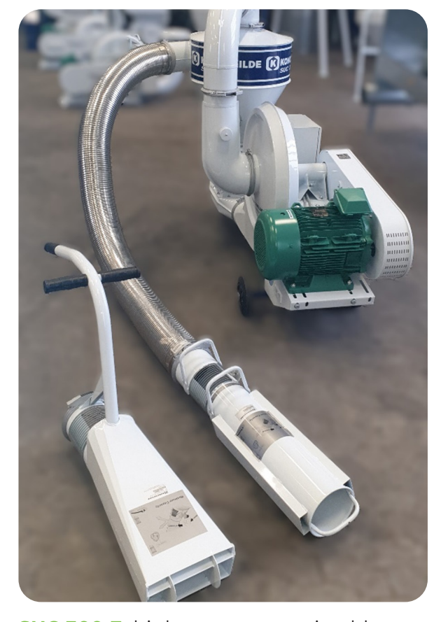
SUC 300 E high pressure suction blower